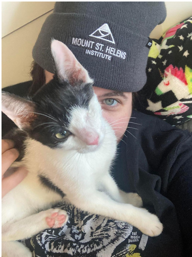
Uno and Heather make a purrfect match

You can help make a life-saving difference by becoming a volunteer foster parent today. Furry Friends will provide food, litter, cat supplies and all medical care. Fosters are required to bring their foster cat to all medical appointments. Please visit our fostering page to fill out an application or to see a document about what is expected. https://furryfriendswa.org/fostering/ or reach out to us at (360) 993-1097 or information@furryfriendswa.org .